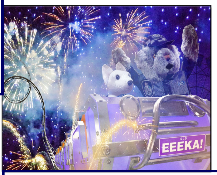
You may even see Constable T. Bear and his friends enjoying a ride or the fireworks!!!

Queensland Police Service branded Corporate Pen in Presentation box,