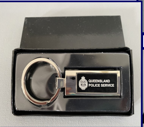
Queensland Police Service branded Key Ring $5.00. (suitable for engraving) great for graduation gift)

Box can be engraved great for graduation gift