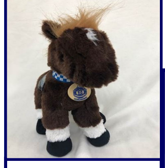
Geronimo named after working Police Horse $12.00