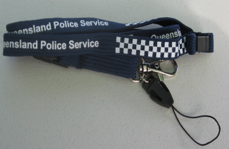
QPS Lanyard $5.00