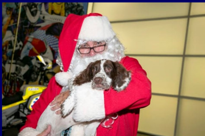
Santa had a special friend to help deliver these precious gifts to the children