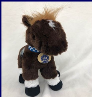
Geronimo named after working Police Horse $12.00