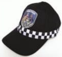
Junior Police Cap adjustable $10.00