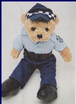
JP Teddy $15.00

Did you see Constable T. Bear and his friend popping up any where? Keep an eye out!!! He'll be making an appearance every now and then!!! These pictures are provided from the CSP "2022 Most Wanted" Calendar.