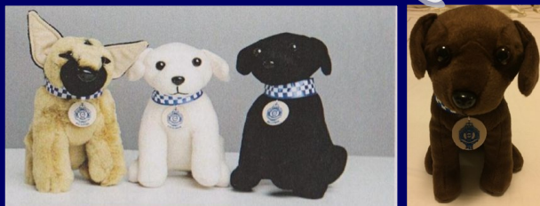
Police Dogs (named after QPS working dogs) $12.00