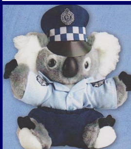
Koala Cop $20.00