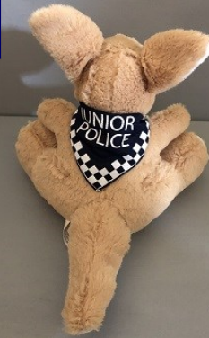
Plush Emu with Junior Police bandana $12.00