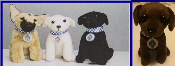
Police Dogs (named after QPS working dogs) $12.00

For the full range of CSP merchandise please visit the CSP store: www.csp.asn.au for prices, availability and information about placing orders.