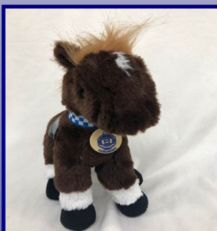
Geronimo named after working Police Horse $12.00