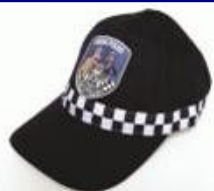
Junior Police Cap adjustable $10.00