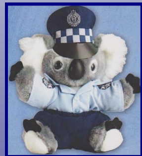
Koala Cop $20.00

All products are available through the CSP online store & at Police Headquarters Store Roma Street