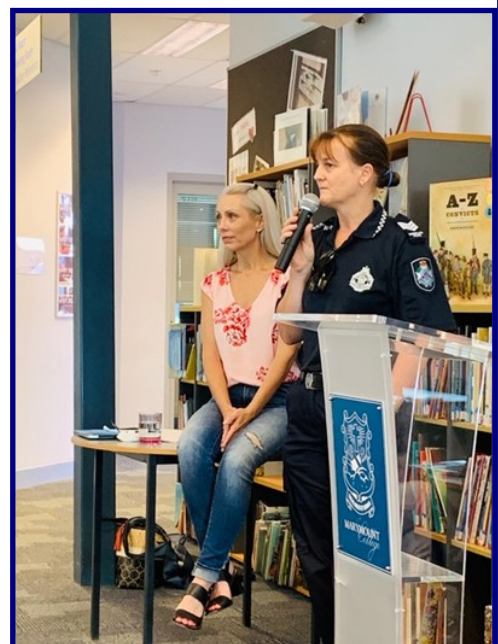
Mary Mount College

YOU CHOOSE now engages with young people around Australia, facilitating a genuine youth-led mission to change driving culture, with highly relate-able messages about Love, Family and the Empowerment of Choice. (. cont pg 5)