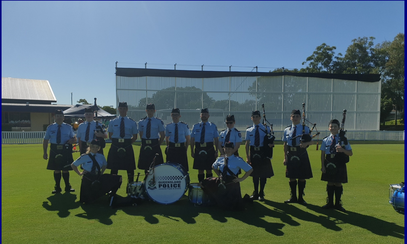
Photos above and left are of the members of the Queensland Police Juvenile Pipes & Drums, from article pg 10.