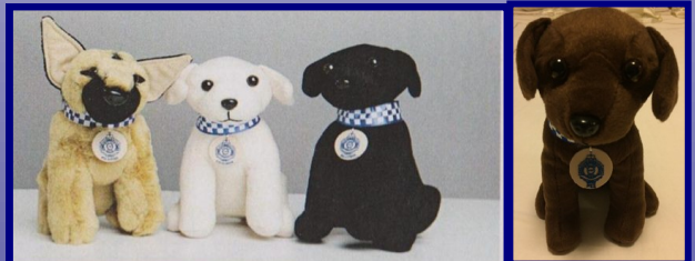
Police Dogs (named after QPS working dogs) $12.00

For the full range of CSP merchandise please visit the CSP store: www.csp.asn.au for prices, availability and information about placing orders.