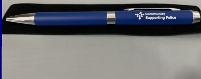
CSP Pen in Pouch $5.00

Queensland Police Service branded Key Ring $5.00. (suitable for engraving) great for graduation gift)