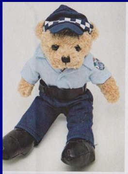
JP Teddy $15.00