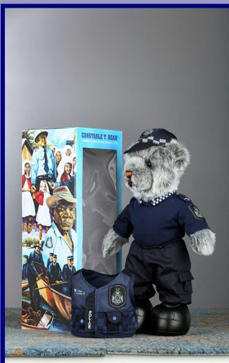
CONSTABLE T. BEAR $50.00