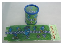
Pen Holders $2.00