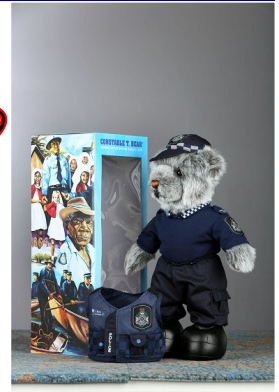
CONSTABLE T. BEAR 2014 $60.00