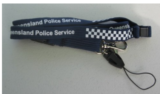
QPS Lanyard $5.00