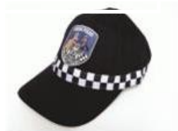
Junior Police Cap (adjustable) $10.00