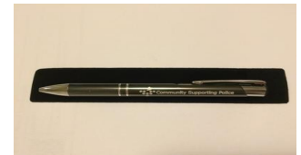
Community Supporting Police Pen in a Pouch $5.00

New Junior Police Polos $30.00 Sizes 2, 4, 6, 8, 10 & 12