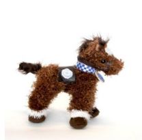
Connie the Horse $12.00