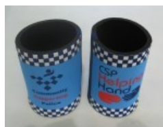
Drink Holders $5.00