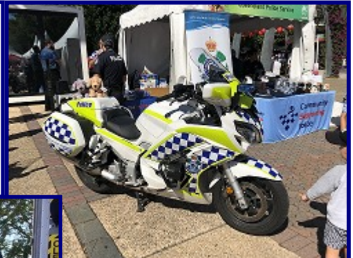
(Right) CSP's cute, cuddly and sometimes cheeky puppies: Buff and Dash took advantage of the opportunity to jump on-board one of the QPS Road Policing Bikes at South Bank during the Festival