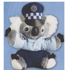
Koala Cop $25.00