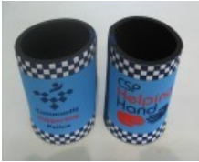
Drink Holders $5.00