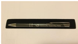
Community Supporting Police Pen in a Pouch $5.00