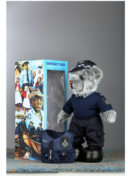
CONSTABLE T. BEAR 2014 $60.00