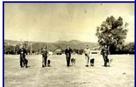
Archive photo from the QPS Dog Squad after 1972.