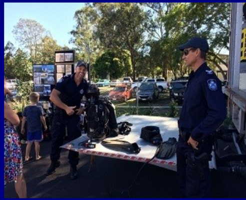
(above) the Dive Unit, (below) Water Police & Road Policing displays at new Caboolture Police Station Open Day 5th May