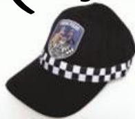
Junior Police Cap $10.00