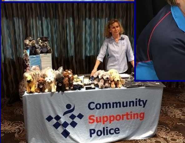
IPSWICH RETIRED POLICE ASSOCIATION PRESENTATION