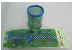
Pencil Holder $2.00