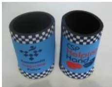
Drink Holders $5.00