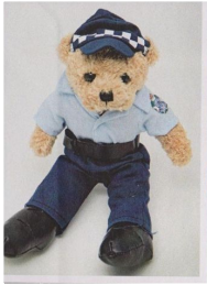
JP Teddy $12.00