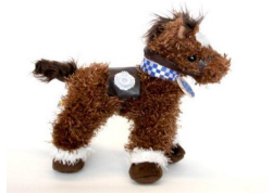
Connie the Horse $12.00

CSP merchandise can be purchased at our stalls at various community events.