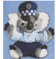
Koala Cop $25.00