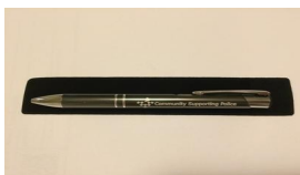
Community Supporting Police Pen in a Pouch