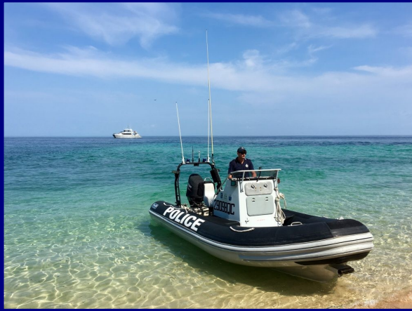
Cairns Water Police urge boaters to take precautions and secure vessels