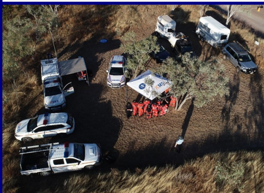
Pilots and observers attend a briefing on the Sunday morning