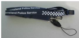
QPS Lanyard $5.00