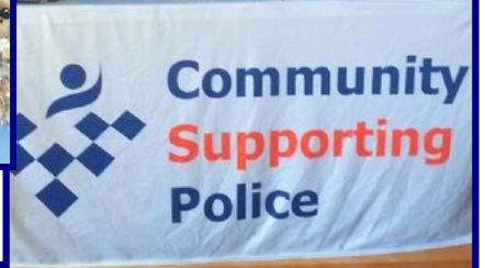
PINE RIVERS SHOW