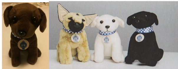
Police Dogs $12.00 (named after QPS working dogs)