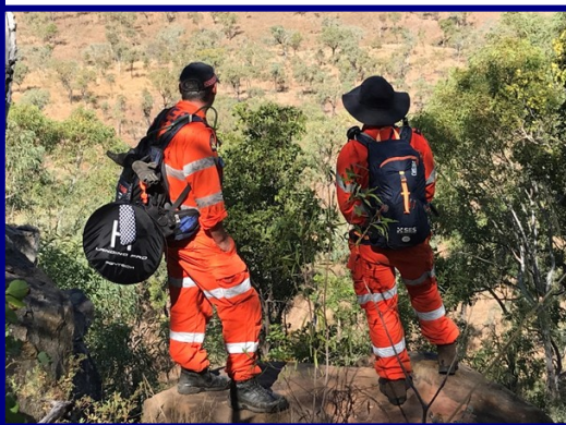
The SES pilot on the left carries a Mavic RPAS and portable landing pad, while the SES accredited observer on the right carries spare batteries and accessories.