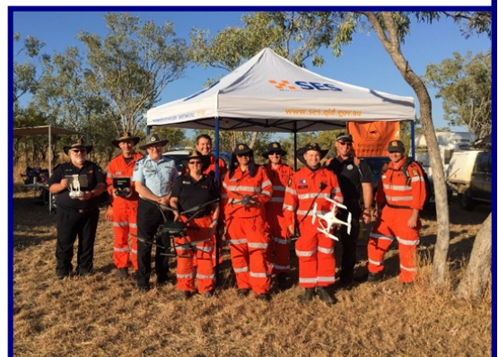
Police and the SES team are ready to head out to search area.