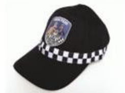
Junior Police Cap $10.00