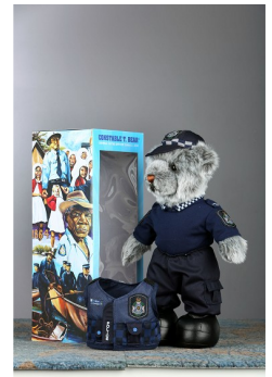
CONSTABLE T. BEAR 2014 $60.00