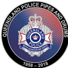
Queensland Police Pipes & Drums Challenge Coins $15.00