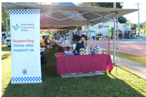
Vic Serchen setting up the CSP stand at Dayboro Day in May