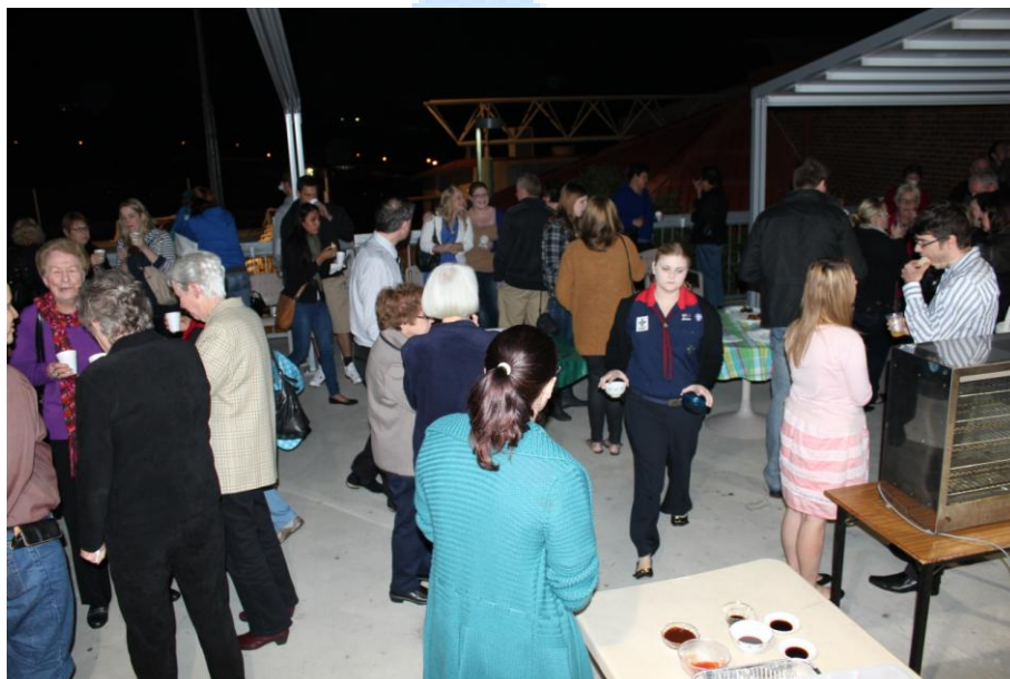
Interval time and a chance to enjoy a nice cuppa and a delicious bit to eat, prepared by the CSP volunteers.